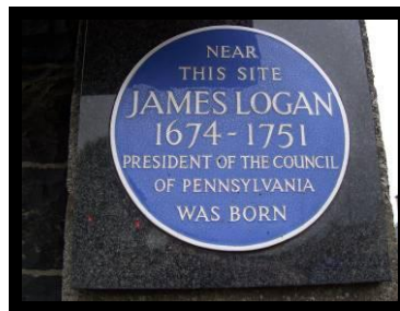
Near the Lurgan Quaker House