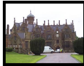
Brownlow Manor, 19 th Century Version (Landlords and Benefactors of the Lurgan Quakers)