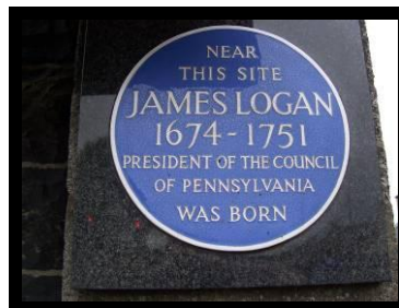
Near the Lurgan Quaker House